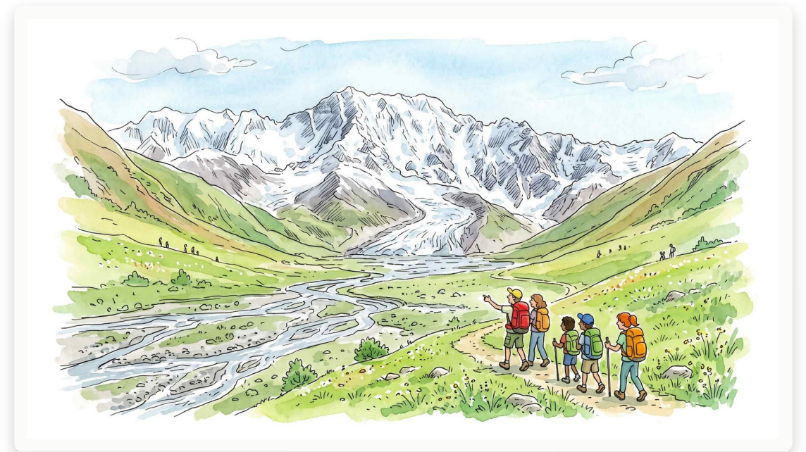
Towards Mount Shkhara