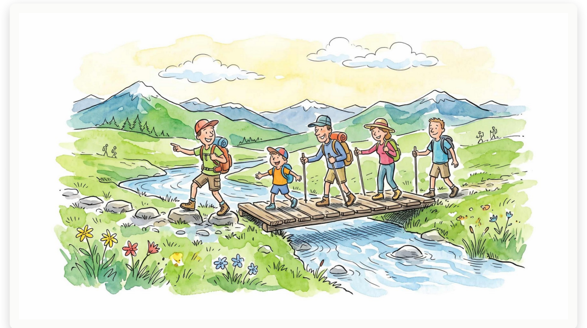
Adventure across Georgia