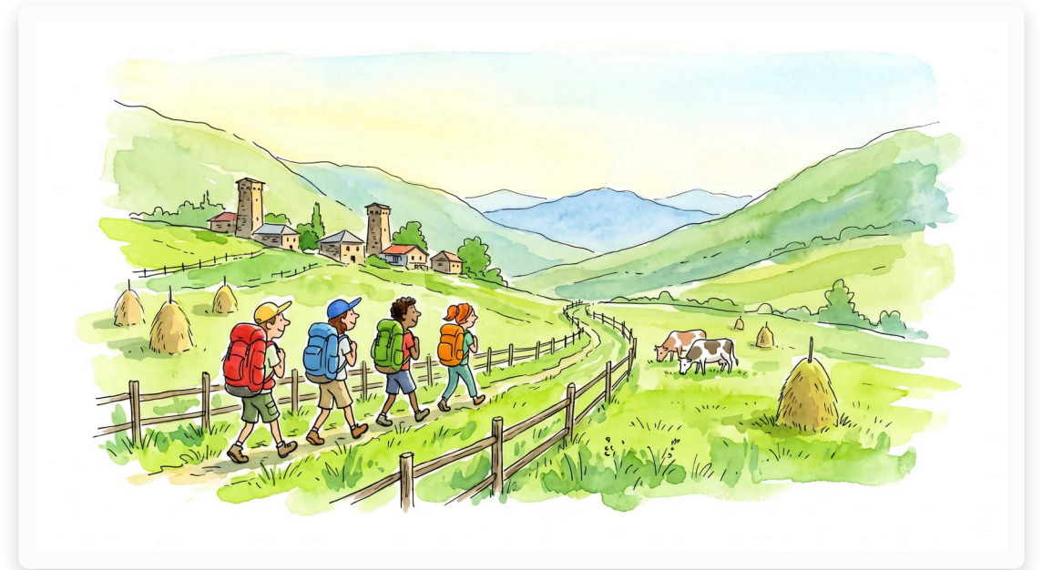
Ushguli & Mount Shkhara