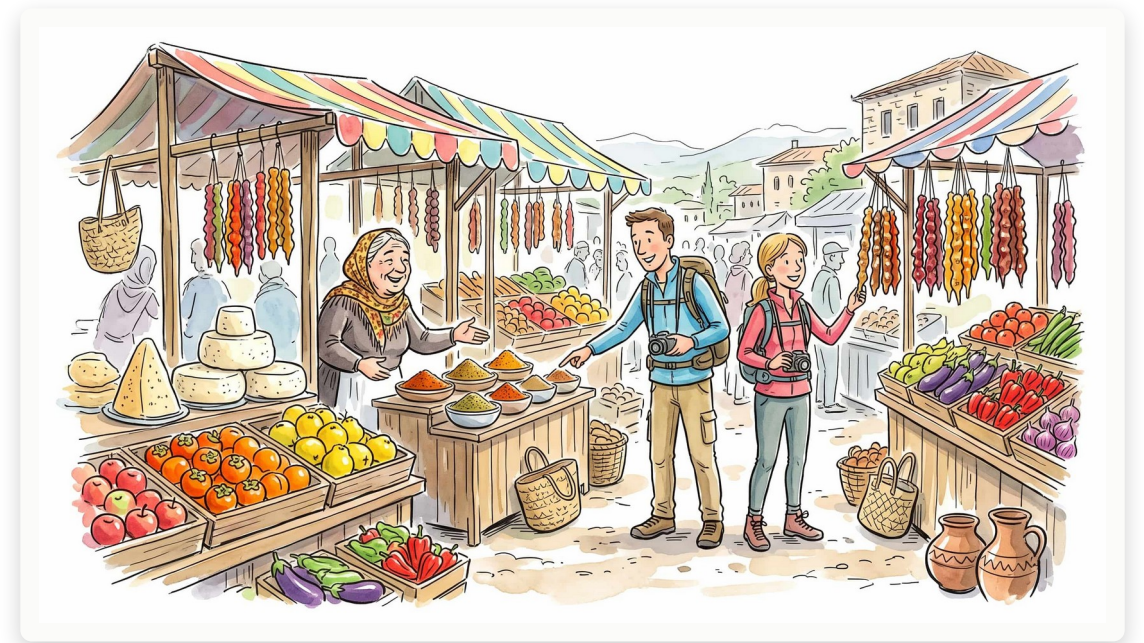
Kutaisi Farmers Market