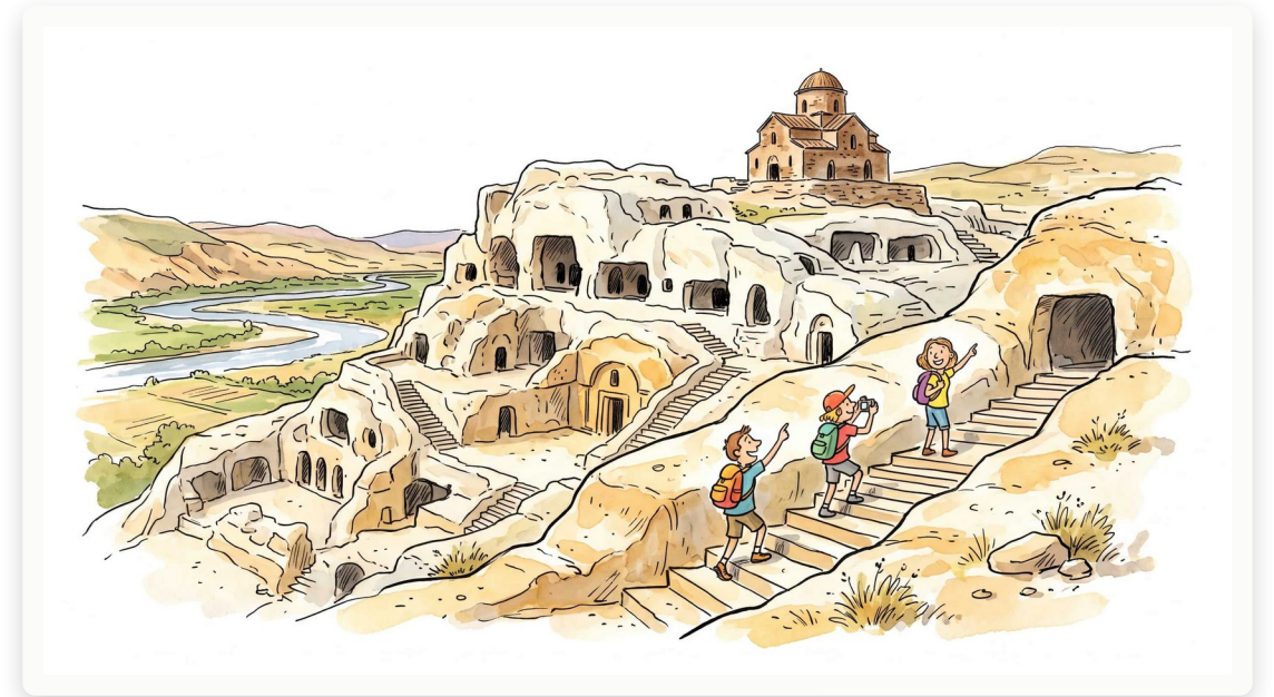
Uplistsikhe Cave Town