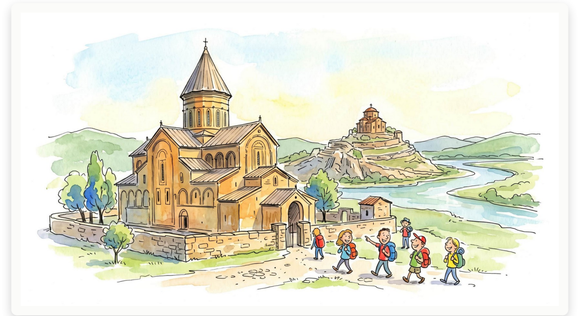
Svetitskhoveli & Jvari