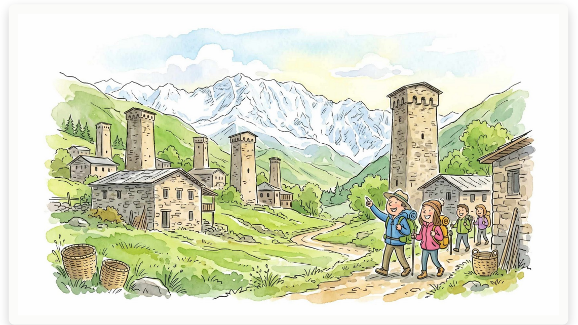
Traditional Svan villages